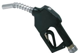
NOZZLE SWITCH CONTROL