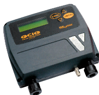
TANK ALARM CONTROL