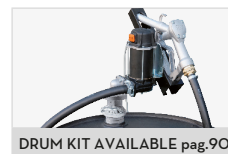
DRUM KIT AVAILABLE pag.90