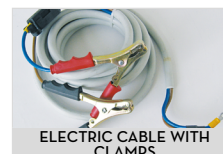
ELECTRIC CABLE WITH CLAMPS