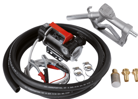
BATTERY KIT 3000 INLINE