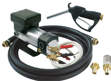
BATTERY KIT OIL