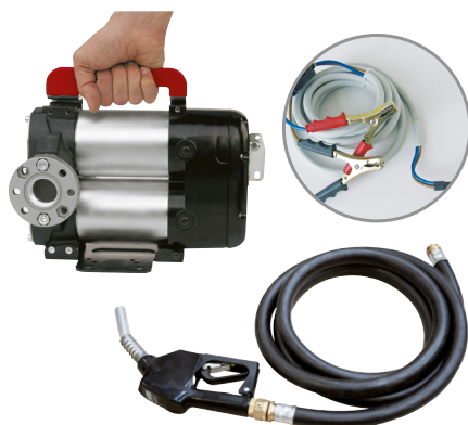
BATTERY KIT BIPUMP