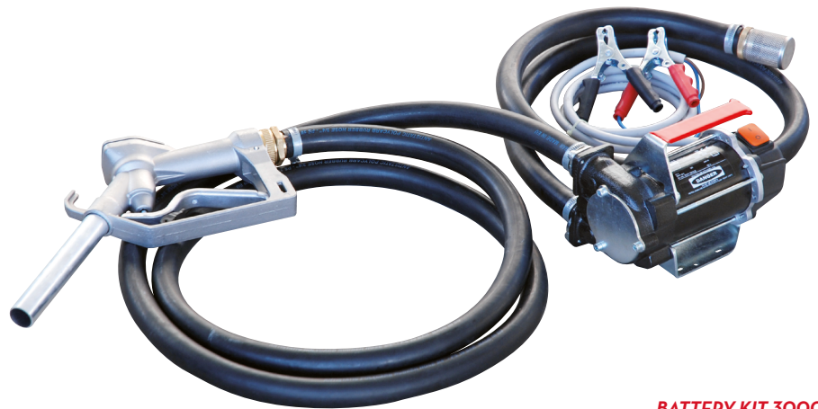
BATTERY KIT 3000