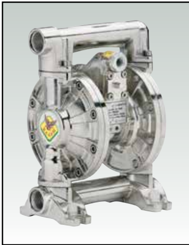
POMPA A MEMBRANA SERIE 1/2" 120-AB DIAPHRAGM PUMP SERIES 1/2" 120-AB